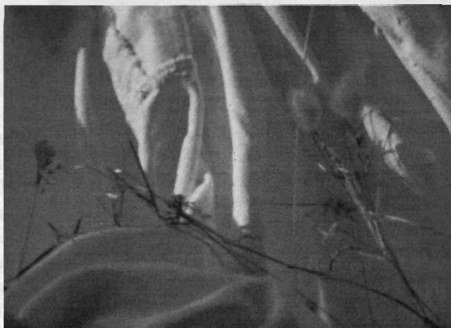
3. Robert Beavers, "Editing and the Unseen," Temenos .

strength, I reach beyond the life-likeness of the actor and the shadow of performance to the figure gathering the light – the life, itself, of the image” 3 – to the end that the viewer must reimagine the film in all its musical tensions and qualifications, at times bringing this subjective order into being through language. Thus, Beavers anticipates the limitations and inevitability of such efforts as this