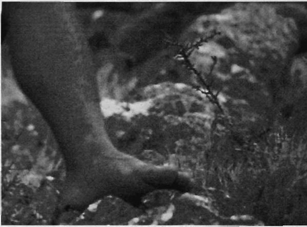
5. "Hautprobe for a spectator."

ful male body – ear, knees, feet, a leg – the light falling from a window onto a crude rug. But around and between such static metonymies he has orchestrated a wide range of movements: the nervous vibration of a pod shot in closeup with a handheld camera; fast panning back and forth over the landscape; abrupt vertical tilts; the trembling hairs on a man's leg. For the most part these movements terminate abruptly, unexpectedly, carrying